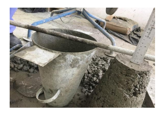
Fig 5: Slump Test