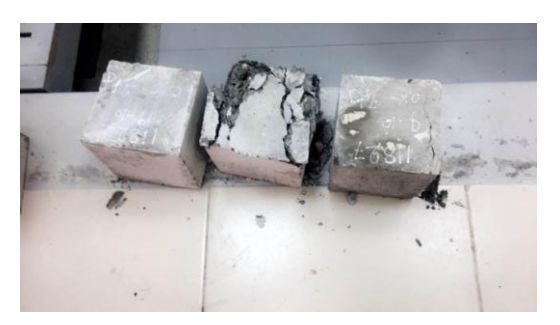
Fig 7: Compressive strength test on concrete