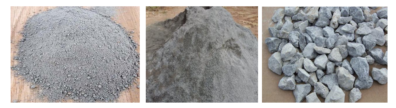
Fig 1: Cement

Ordinary Portland cement (OPC) was used for the preparation of concrete cubes. Crushed rock with size less than 5 mm was used as Fine Aggregate (FA). Sieve analysis test was carried out to determine the fineness modules of fine aggregate. Coarse Aggregate (CA) with maximum size 20 mm was used for concrete. Water free from organic materials or acids, oils, alkalis, salts, sugar and or any other foreign matter was used for mixing. Figures 1, 2 and 3 show the cement, fine and coarse aggregate respectively. Based on sieve analysis results, fineness modulus of fine and coarse aggregate are 3.91 and 4.178 respectively.