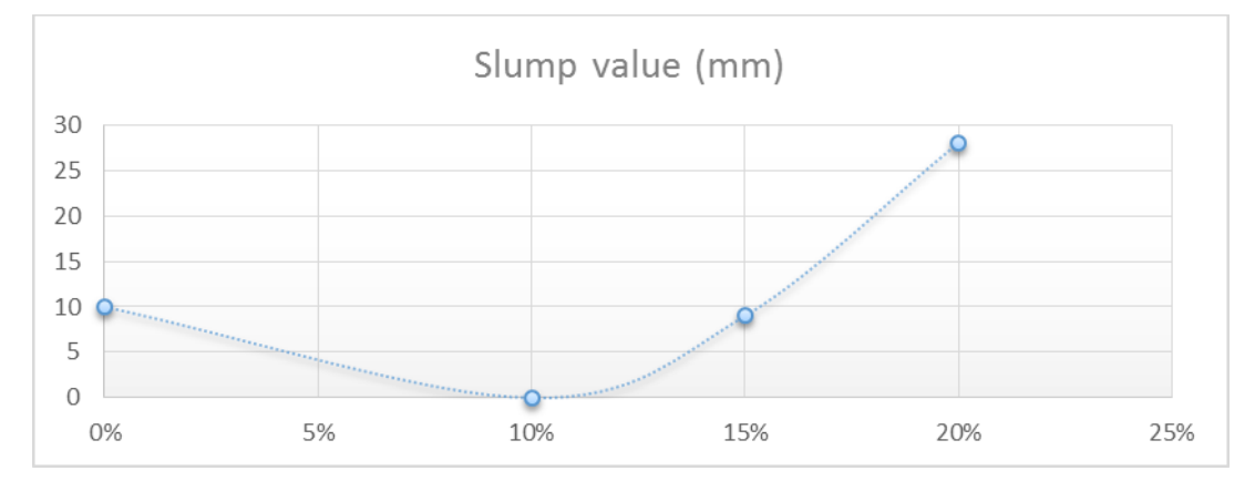
Fig 6: Slump test results