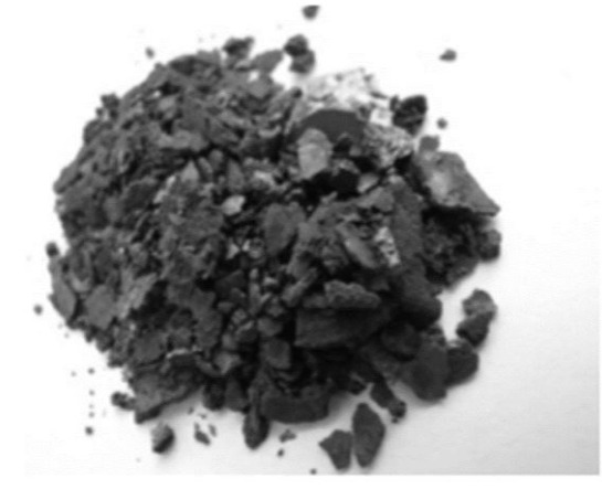
Fig 4: Iron Waste

Iron waste has been collected from the Sohar steel plant, Oman and added with concrete as partial replacement of fine aggregate. Figure 4 shows iron waste and sieved into the size less than 5 mm and mixed with concrete.